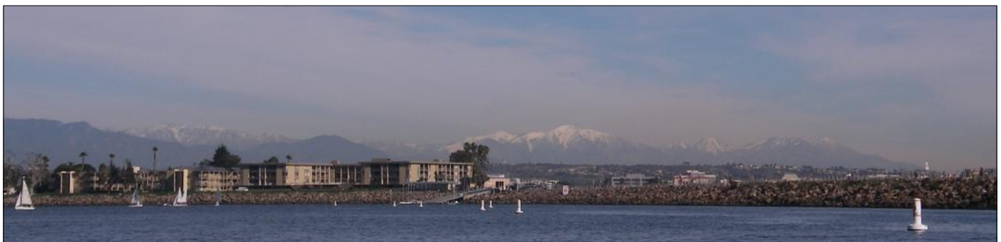
Snowcapped mountains as seen from sunny Marina del Rey, January 2011