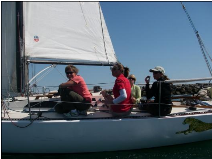
Agua Cheetah returns to the marina after the successful bow clinic in September.