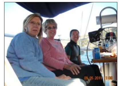
Is it Happy Hour yet?

The seas and winds were calm as we motored back to the mainland. We all enjoyed our stay at the rugged yet serene island and left feeling rested and renewed.