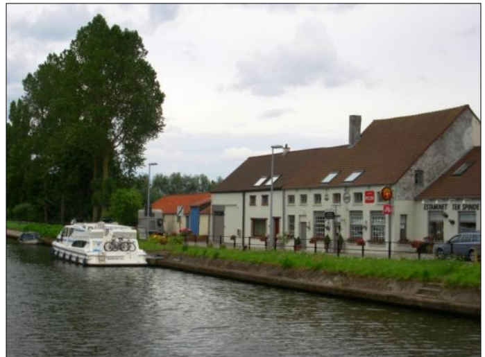
Mahalo Sailing's chartered boat tied up for the night next to a tavern outside of Ostende