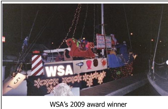
WSA's 2009 award winner

The team needs planners, designers, decorators and rock stars to sail with us. Concept and design meetings will be scheduled in November. Work parties to create the decorations are tentatively set for Saturday and Sunday, December 4 and 5, and then we will decorate and boat and participate in the competition and parade on Saturday December 11.