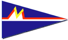
MARINA VENICE YACHT CLUB