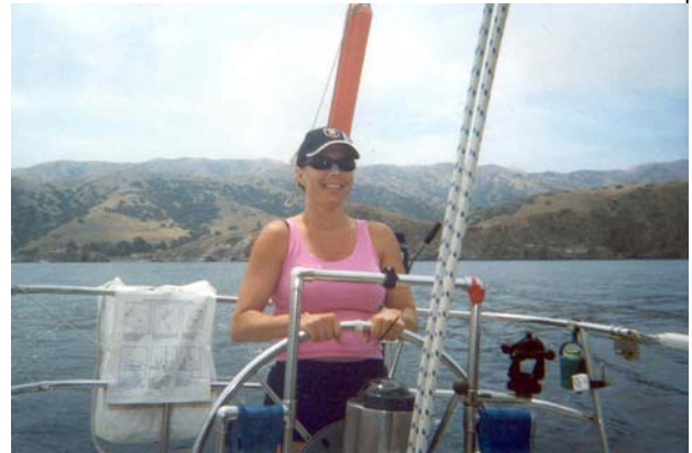
Sailing Lightning off Catalina