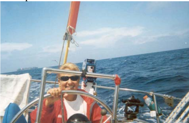
New Cruisers at the helm