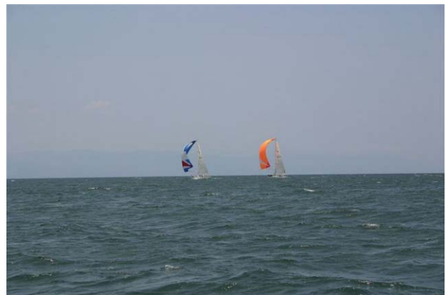
The WSA/Marina del Rey and Long Beach teams battling it out downwind in Puerto Vallarta