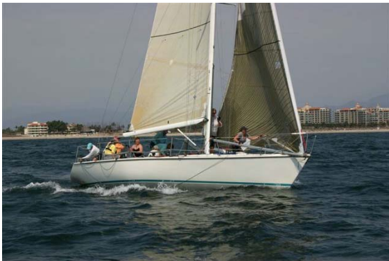
The WSA team getting ready to tack

Downwind was the key to Saturday's racing, since the boats were very close on the upwind legs. The wind was blowing 12-15 or so, and the chop wasn't an issue like Friday. The second race started with two OCS boats, Mexico and Dana Point.