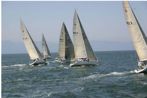
Sunday's start in Puerto Vallarta

We did some quick math on the boat and realized that second in Sunday's race would give us a first overall in the regatta. What we didn't realize was that first in Sunday's race for Long Beach would move the Mexican team into third place. Our choice – protect our first overall, don't get crazy and make a mistake that would cost us the regatta – opened the door for Long Beach, and once they got a foot in, they weren't pulling it out!