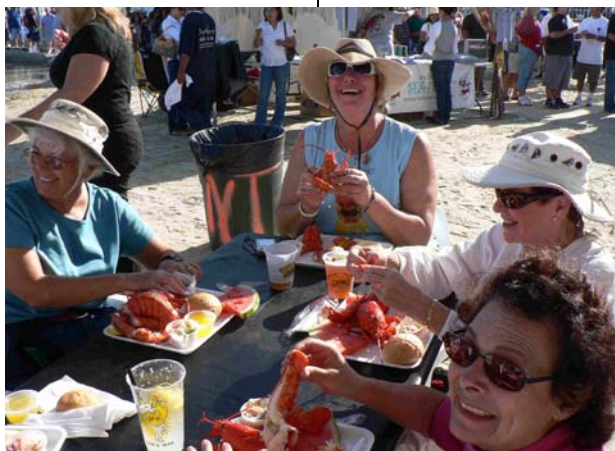
WSA members at the 11 th annual Lobster Fest in Redondo, September 24, 2006

In December we have both the boat parade (the WSA entry is always spectacular and wins a prize or two!) and our end of year holiday