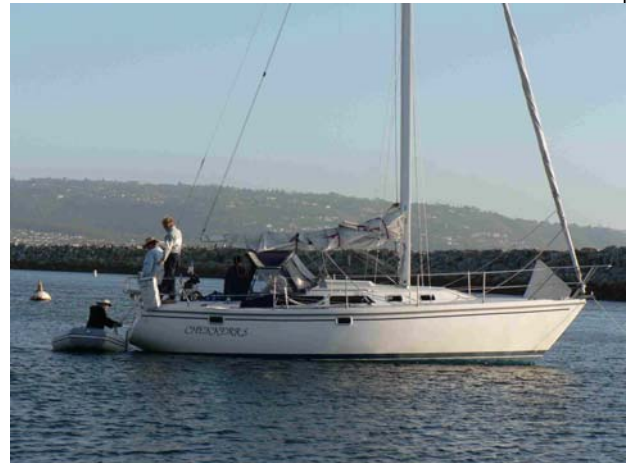
Chekkerrs at anchor

That was the good part, now comes the great part. We cleared the King Harbor breakwater about 6:15PM and hit sustained winds of 14 to 16kts from the west with 4 to 6ft. seas. Chekkerrs motor sailed up the way she came down, to take 2ES buoy on starboard. Large waves broke over the coaming and the windward crew dashed for foulies. Barb held our course as she helmed through Mr. Toads wild ride to 2ES. The sun set and Rosemary saw the green flash. "Yahoo" frequently went up from the crew as the boat bucked up and down. Just a sliver of moon gave faint light as the darkness settled in. Rounding 2ES buoy, we set the jib, silenced the motor and surfed down the waves on a beam reach at hull speed to the MDR's south entrance. What a glorious ride!