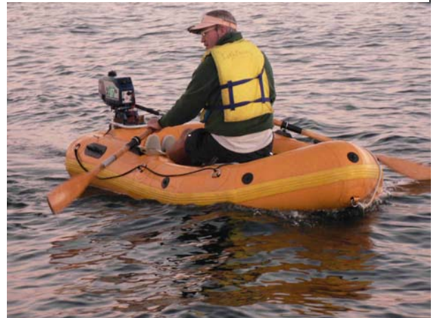
John Melville's Taxi Service